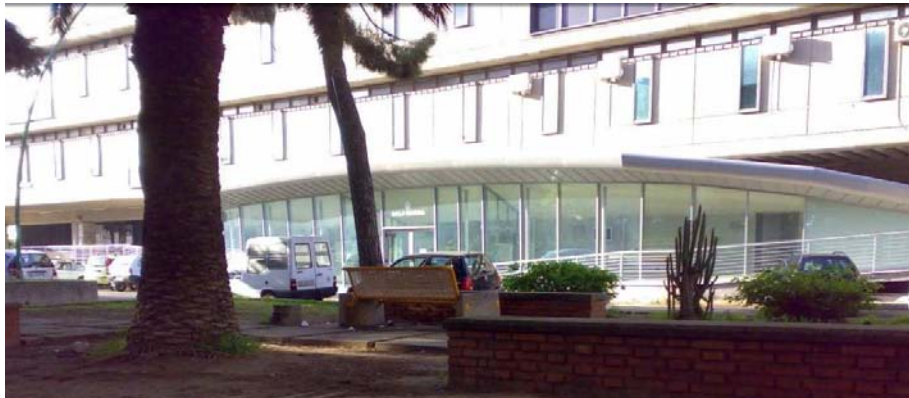
Conference hall “Aula Magna”

To get to the conference hall “Aula Magna”, walk straight across the gardens and find the hall in front of you.